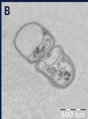
Killed Clostridium perfringens in the presence of Duodecim