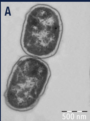
Viable Clostridium perfringens